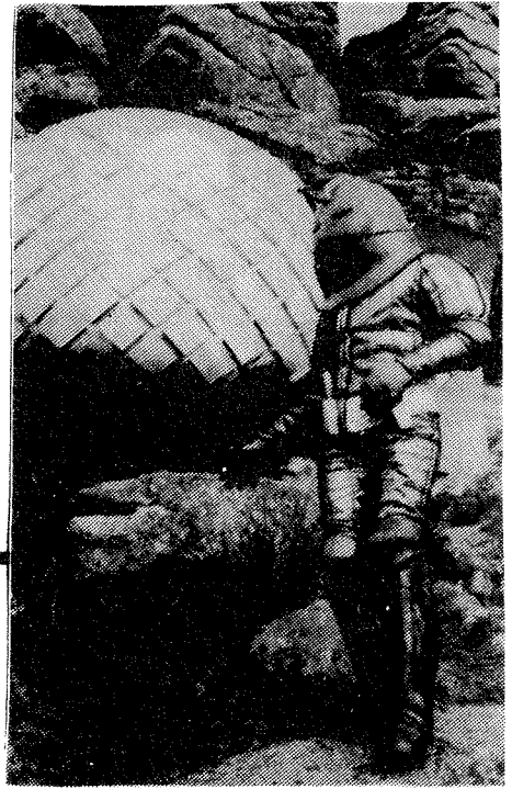
Field Major Styre — the beast with five fingers